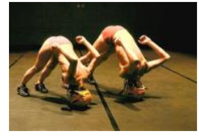
"La Vision du Lapin" by Laurence Yadi and Nicolas Cantillon

The festival will feature performances by artists from all over Europe, who will introduce their audiences to the latest in contemporary choreography and give residents of the Lille region a rare chance to see some of the most inventive international artists in the business brought together in a single spot. Along with the many performances, the festival will also