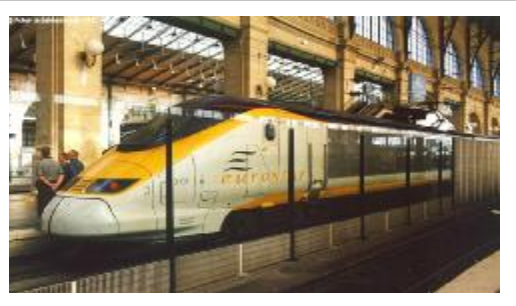
The Eurostar in the Gare du Nord, Paris.

In related news, Prime Minister Jean-Pierre Raffarin inaugurated the assembly line of the A380 super-jumbo on May 7 in Toulouse. The A380, built by Airbus, will be the largest civilian airliner in the sky when it takes flight in early 2005. The Airbus factory is itself a breath-taking wonder: it measures 490 meters long by 250 wide and 46 high (539 by 275 by 50.6 yards).